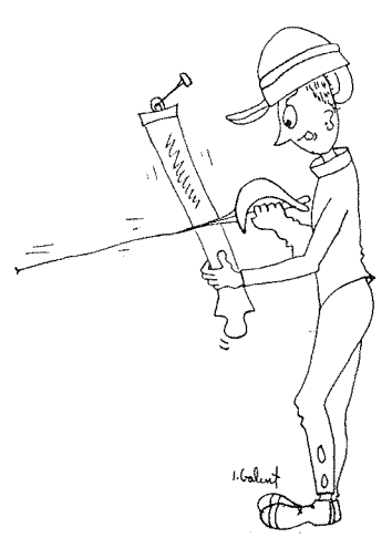
"The Maestro says I've got to sharpen my game."

The 1954 Central American and Caribbean Games will be held from March 6 to 20 in Mexico City. These games are of special interest to the United States this year because they will serve as a prelude to the II Pan American Games to be held in the same city and at about the same time in 1955.